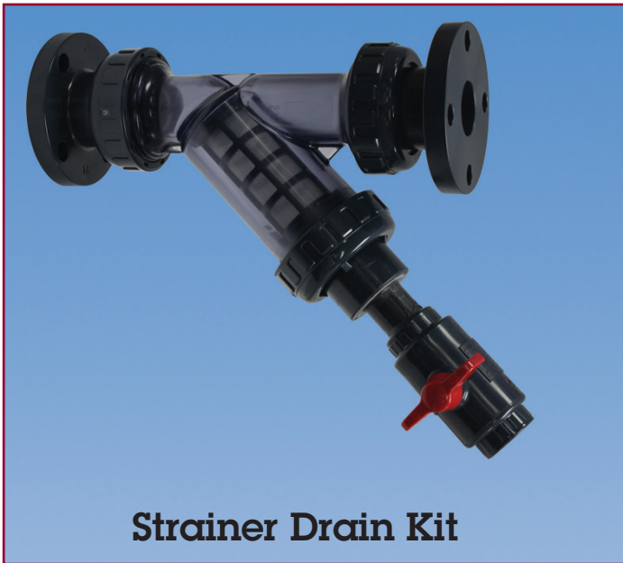
Strainer Drain Kit

Asahi/America Inc., introduces Sediment Strainer Drain Socket kits complete with Omni® Type-27 ball valves for quick and easy cleaning of sediment strainer screens without removing the screen support assembly. The ball valve can be opened to purge the screen area of waste and debris. Valve is supplied loose for piping waste pipe to desired location.